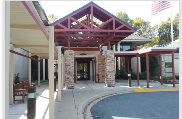
Entrance to Clubhouse 2

Leisure World Computer Center, Inc. A 501(c)(3) Non-Profit Organization