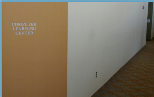
Photo outside the door to the Center

The Leisure World Computer Center Inc. is a 501(c)(3) tax exempt non-profit organization, in the state of Maryland. On October 1, 1992, the center was established and from that came the Computer Learning Center that is operated by the Leisure World Computer Center, Inc. The corporation consists of a 100% volunteer Board of Directors, monitors, and other volunteers who operate the Computer Learning Center.