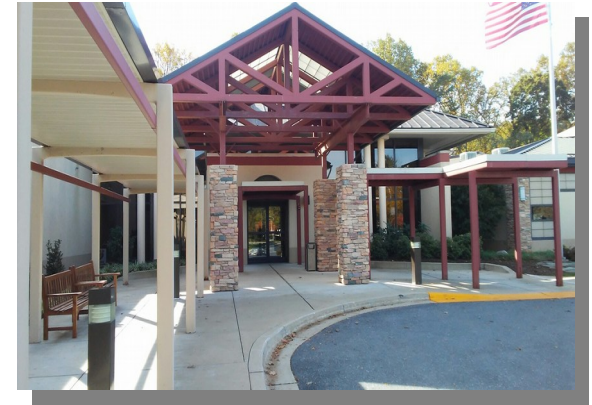
Entrance to Clubhouse 2

Phone: 301-598-1320 E&R Office Clubhouse 2 Website: www.computerctr.org