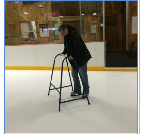
Really? An Ice Walker