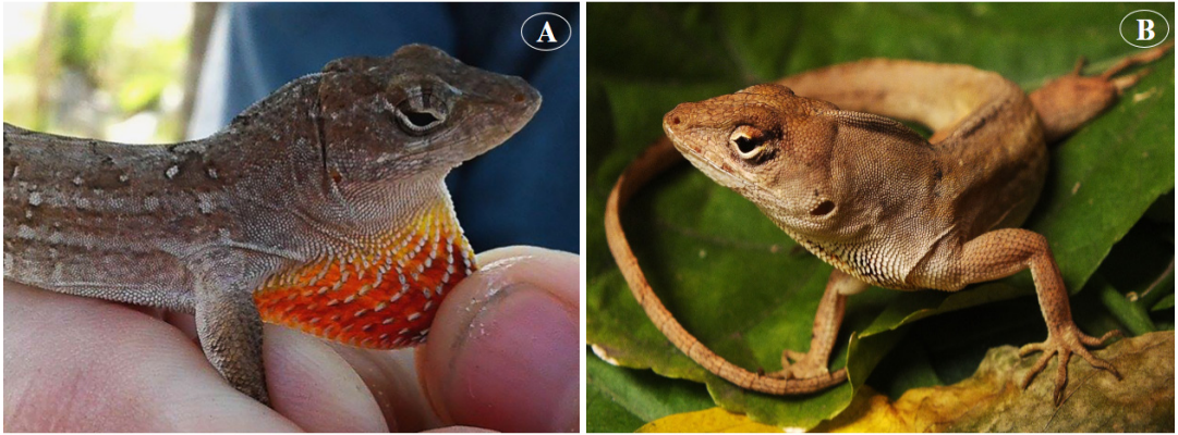
Figure 2. Adult males of Anolis sagrei collected at the Galeão International Airport, in Rio de Janeiro city, Brazil. A) detail of the dewlap of a specimen (MNRJ 26779); B) uniform colour pattern of another specimen (MNRJ 26784).

such as aboard commercial ships (Amador et al. , 2017). In this contribution, we provide the first record of this aggressive invasive lizard in Brazil.