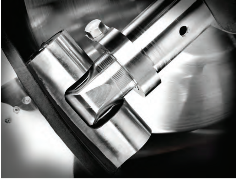
Fan blades are resiliently mounted to machined aluminum hub.