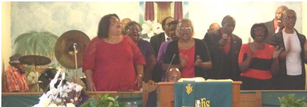
Canaan Missionary Baptist Church Choir

Don't look for Jesus among the dead. You've got to make sure you're worshipping and not working. You've got to make sure you stay out of his face, but stay at his feet. You've got to make sure you stop talking, and start listening. If you do these things, then you'll be able to have the power that you deserve to have.