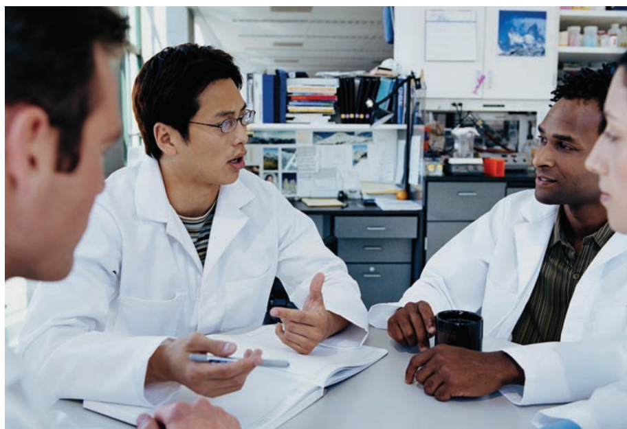
Fig. 2. Scientists routinely debate their theories, their data, and the implications. Research shows that argumentation in the classroom can improve conceptual learning.

In addition, notions of what constitutes scientific reasoning differ somewhat. Much of the research on individual's capability with scientific reasoning is a product of laboratory-based,