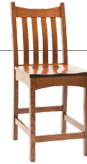
24" or 30" High Base Stationary Bar Chair 18"w x 16 3/4"d x 19 1/4"h Back Ht.