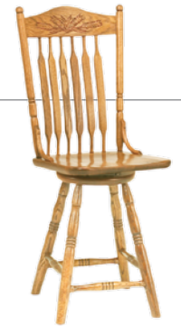
24" or 30" High Base Swivel Barstool 19"w x 18"d x 23"h Back Ht.