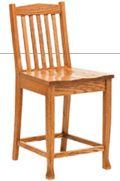
24" or 30" High Base Stationary Bar Chair 19"w x 17"d x 17"h Back Ht.