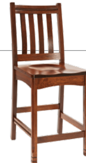
24" or 30" High Base Stationary Bar Chair 18"w x 18"d x 19"h Back Ht.