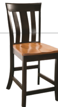
24" or 30" High Base Stationary Bar Chair 19"w x 18"d x 20"h Back Ht.