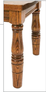
Optional Farmhouse Legs