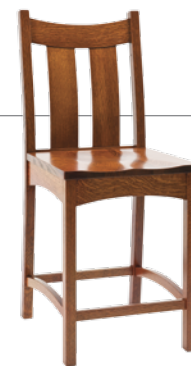
24" or 30" High Base Stationary Bar Chair 18"w x 16 3/4"d x 19 1/4"h Back Ht.