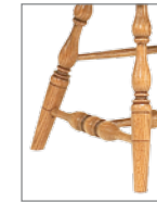
Optional S-9 Legs