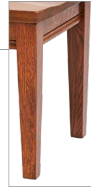
Optional Trotter Legs