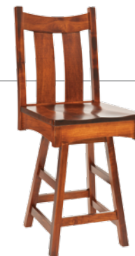
24" or 30" High Base Swivel Barstool 18"w x 17"d x 19 1/4"h Back Ht.