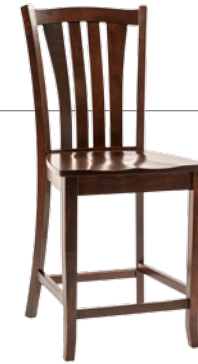
24" or 30" High Base Stationary Bar Chair 19"w x 17"d x 19 1/2"h Back Ht.