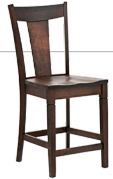
24" or 30" High Base Stationary Bar Chair 20"w x 17"d x 21"h Back Ht.