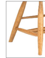
Optional Plain Legs