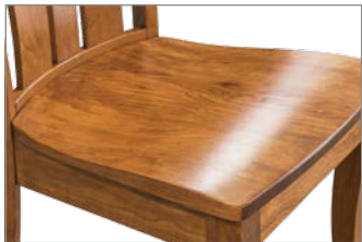
Benton Roundover Seat