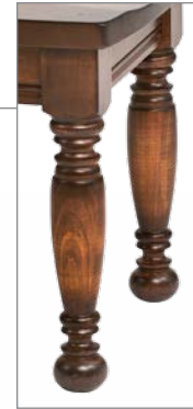
Optional Bellville Legs