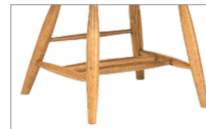
Optional Plain Legs