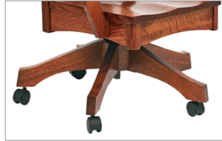
Mission No-Gas Lift