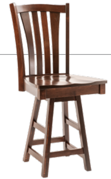
24" or 30" High Base Swivel Barstool 19"w x 17"d x 19 1/2"h Back Ht.