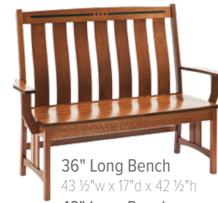
36" Long Bench 43 1/2"w x 17"d x 42 1/2"h 48" Long Bench 55 1/2"w x 17"d x 42 1/2"h