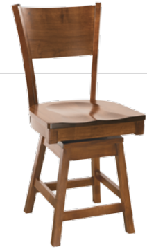
24" or 30" High Base Swivel Barstool 19"w x 17 1/2"d x 19 1/4" h Back Ht.