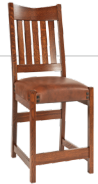
24" or 30" High Base Stationary Bar Chair 19"w x 17 1/2"d x 23 1/2"h Back Ht.