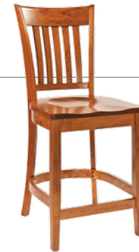
24" or 30" High Base Stationary Bar Chair 19"w x 17 3/4"d x 19 1/2"h Back Ht.