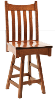
24" or 30" High Base Swivel Barstool 18"w x 16 3/4"d x 19 1/4"h Back Ht.