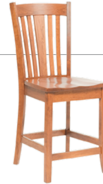
24" or 30" High Base Stationary Bar Chair 20"w x 17"d x 21"h Back Ht.