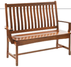
36" Long Bench 48 1/2"w x 17"d x 41 1/2"h 48" Long Bench 55 1/2"w x 17"d x 41 1/2"h