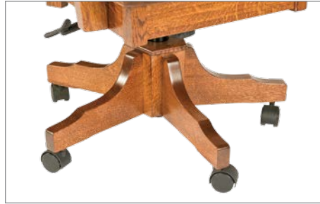
Mission Gas Lift