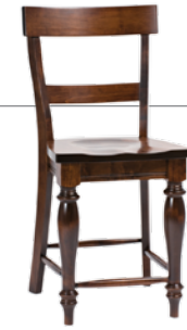
24" or 30" High Base Stationary Bar Chair 19"w x 18"d x 19 1/2"h Back Ht.