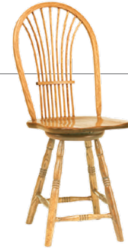
24" or 30" High Base Swivel Barstool 19"w x 18"d x 23 ½"h Back Ht.