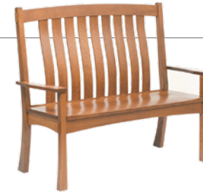
36" Long Bench 40 ½"w x 17"d x 42 ½"h 48" Long Bench 52 ½"w x 17"d x 42 ½"h