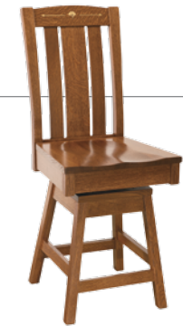
24" or 30" High Base Swivel Barstool 18 ½"w x 17"d x 21"h Back Ht.