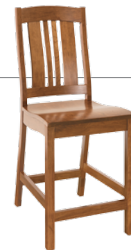
24" or 30" High Base Stationary Bar Chair 18"w x 18"d x 20"h Back Ht.