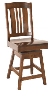
24" or 30" High Base Swivel Barstool 18"w x 18"d x 20"h Back Ht.