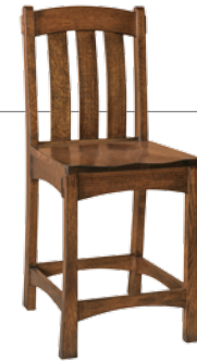
24" or 30" High Base Stationary Bar Chair 18"w x 17"d x 18 ½"h Back Ht.