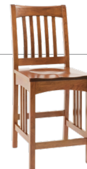
24" or 30" High Base Stationary Bar Chair 18"w x 17 1/2"d x 19 1/4"h Back Ht.