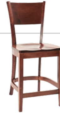
24" or 30" High Base Stationary Bar Chair 19"w x 17 1/2"d x 19 1/4" h Back Ht.