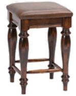
24" or 30" High Stationary Bar Chair without Back 16"w x 16"d