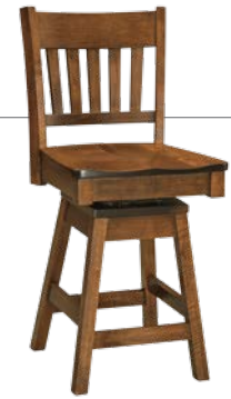
24" or 30" High Base Swivel Barstool 18"w x 16 1/2"d x 15"h Back Ht.