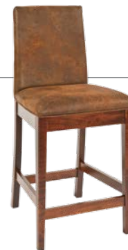
24" or 30" High Base Stationary Bar Chair 19 1/2"w x 17"d x 16 1/2"h Back Ht.