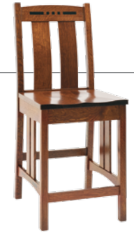
24" or 30" High Base Stationary Bar Chair 18"w x 16 3/4"d x 19 1/4"h Back Ht.