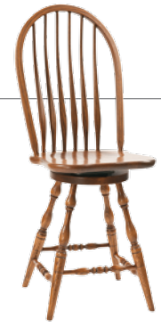
24" or 30" High Base Swivel Barstool 19"w x 18"d x 23"h Back Ht.