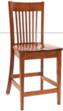
24" or 30" High Base Stationary Bar Chair 19"w x 17 1/4"d x 20"h Back Ht.