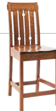
24" or 30" High Base Stationary Bar Chair 18 ¼" w x 16 ¾" d x 20 ½" h Back Ht.