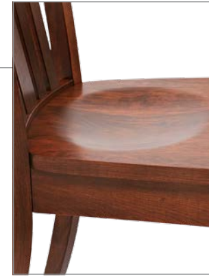
Optional Deep Scoop Seats