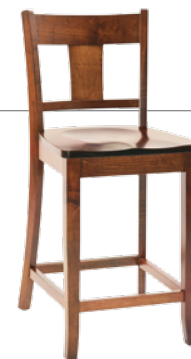
24" or 30" High Base Stationary Bar Chair (Shown) 17"w x 16 1/2"d x 15"h Back Ht.