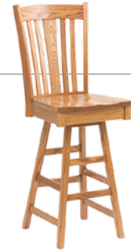
24" or 30" High Base Swivel Barstool 20"w x 17"d x 21"h Back Ht.