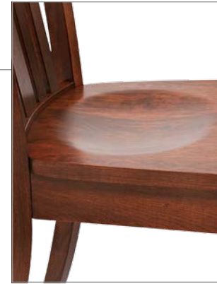
Optional Deep Scoop Seats