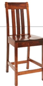
24" or 30" High Base Stationary Bar Chair 18"w x 16 3/4"d x 20 1/2"h Back Ht.