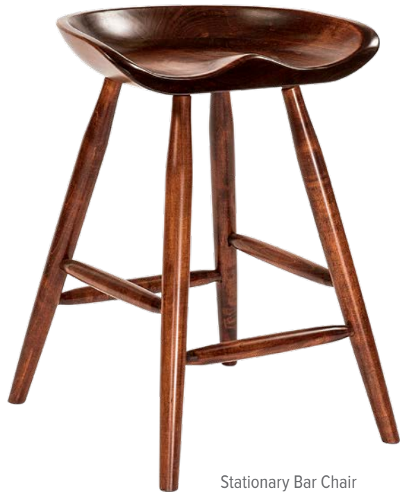
Stationary Bar Chair