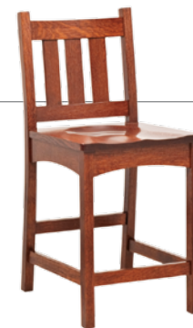
24" or 30" High Base Stationary Bar Chair 18"w x 18"d x 19"h Back Ht.