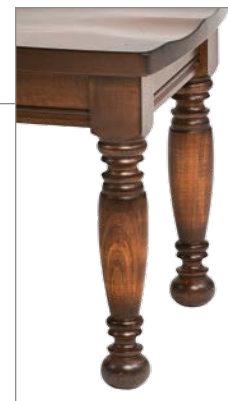
Optional Bellville Legs