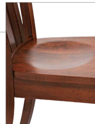
Optional Deep Scoop Seats