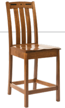
24" or 30" High Base Stationary Bar Chair 18 1/2"w x 17"d x 20 1/2"h Back Ht.