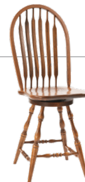
24" or 30" High Base Swivel Barstool 19"w x 18"d x 23"h Back Ht.