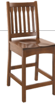
24" or 30" High Base Stationary Bar Chair 18"w x 18"d x 19"h Back Ht.