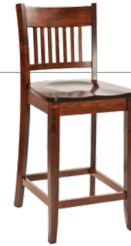
24" or 30" High Base Stationary Bar Chair 18"w x 16 1/2"d x 15"h Back Ht.