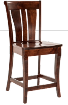
24" or 30" High Base Stationary Bar Chair 19"w x 17"d x 19"h Back Ht.