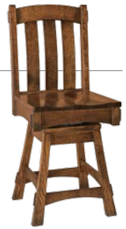
24" or 30" High Base Swivel Barstool 18"w x 17"d x 18 ½"h Back Ht.