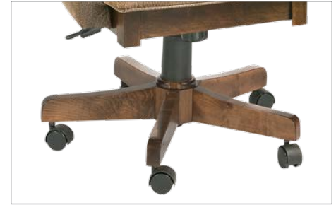
Caswell Gas Lift

Note: Selected chair styles are available as barstools. All orders are shipped with standard swivel unless "Return-O-Matic" swivel is specified on order.