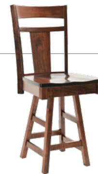
24" or 30" High Base Stationary Bar Chair 19 1/4"w x 17 1/4"d x 21"h Back Ht.