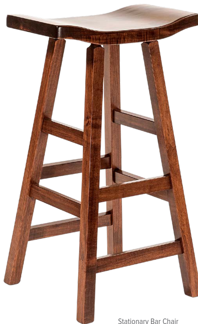
Stationary Bar Chair

Shown in Brown Maple with Coffee Stain (left)