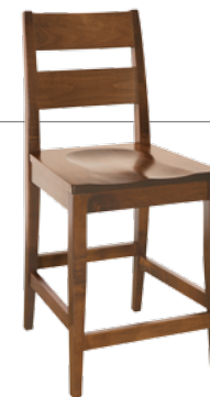
24" or 30" High Base Stationary Bar Chair 19"w x 17"d x 18"h Back Ht.