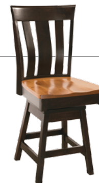
24" or 30" High Base Swivel Barstool 19"w x 18"d x 20"h Back Ht.