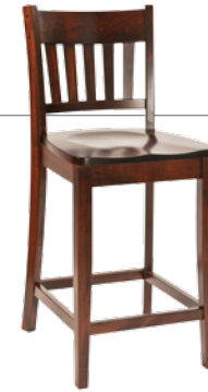
24" or 30" High Base Stationary Bar Chair 17"w x 16 1/2"d x 15"h Back Ht.