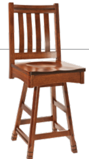
24" or 30" High Base Swivel Barstool 18"w x 18"d x 19"h Back Ht.