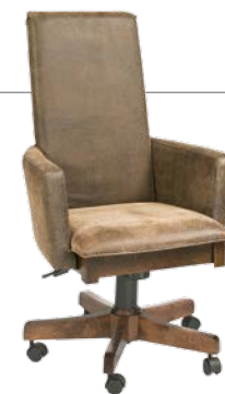
Desk Chair with Caswell Lift