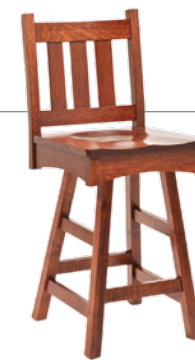
24" or 30" High Base Swivel Barstool 18"w x 18"d x 19"h Back Ht.