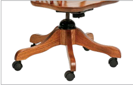
Standard No-Gas Lift