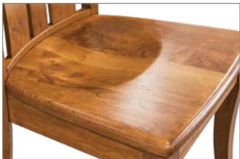
Deep Scoop Seat shown with Optional Roundover Edge