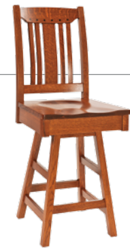
24" or 30" High Base Stationary Bar Chair 18 1/4"w x 17 1/2"d x 20 3/4"h Back Ht.