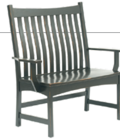
36" Long Bench 43 1/2"w x 17"d x 42 1/2"h 48" Long Bench 55 1/2"w x 17"d x 42 1/2"h