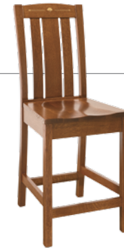
24" or 30" High Base Stationary Bar Chair 18 ½"w x 17"d x 21"h Back Ht.