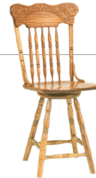
24" or 30" High Base Swivel Barstool 22"w x 18"d x 22"h Back Ht.