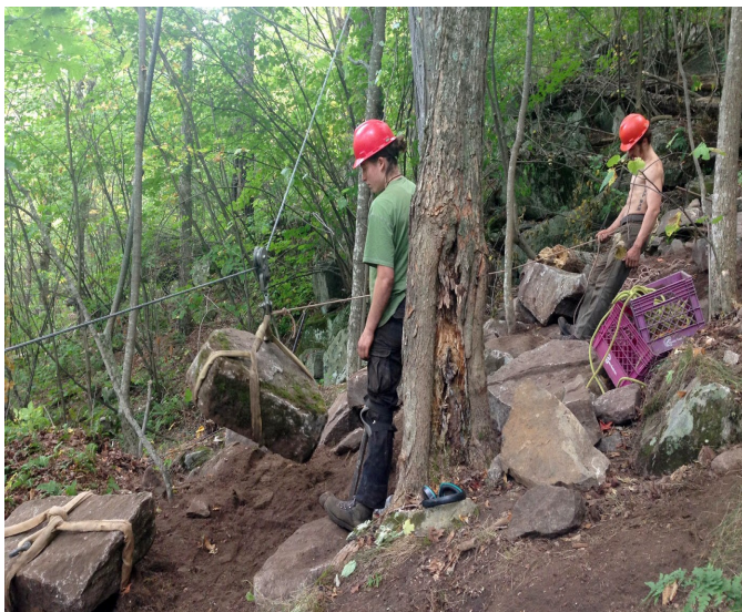
The Adirondack Mountain Club Trail Crew At Work On The Ranger Trail; Both photos - Autumn 2016 Hikers Descending Rock Staircase At The Cliff Face Built By ADK and Tahawus Trails

We've recently done two publicity segments on Mountain Lakes PBS and North Country Public Radio. The links to these are: http://mountainlake.org/programs/mountain-lake-journal and http://www.northcountrypublicradio.org/news/story/32617/20160926/second-round-of-trail-repairs-underway-on-poke-o-moonshine