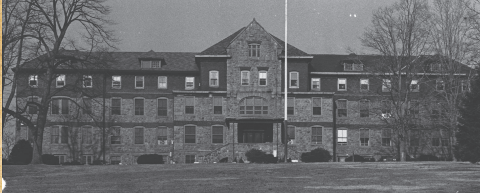
The main building on campus