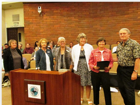
Receiving our 90th Anniversary Proclamation Plaque from the City Today we are in our 93rd year.

The Woman's Club of Seal Beach is committed to supporting and promoting the educational, civic and charitable advancement of our community through volunteer service and fundraising activities while encouraging friendship among our members.