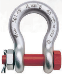
G-2140 / S-2140

G-2140 meets the performance requirements of Federal Specification RR-C-271F, Type IVA, Grade B, Class 3, except for those provisions required of the contractor. For additional information, see page 452.