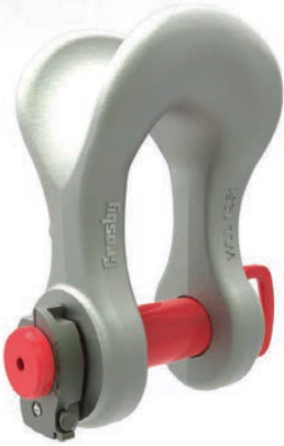
G-2170 Grommet Shackle