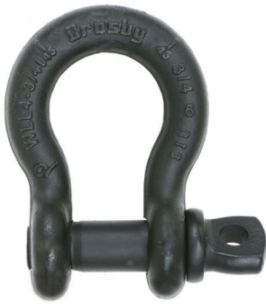
S-209T THEATRICAL SHACKLE