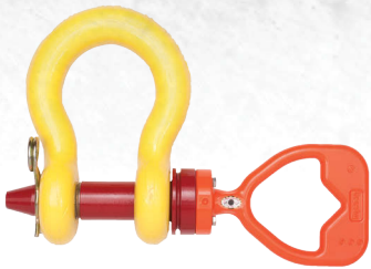
G-209RP ROV SHACKLE with "D" Style Handle Shown