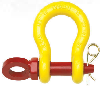
G-209R ROV SHACKLE