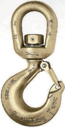
S-322CN / AN (L-322AN Shown)