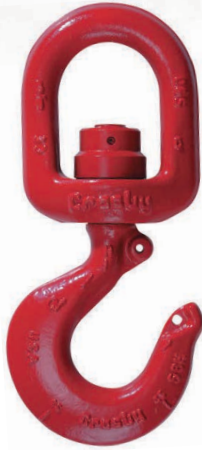
S-3322B Swivel Hooks with Bearing

New anti-friction bearing design allows hook to rotate freely under load.