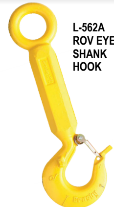
L-562A ROV EYE SHANK HOOK