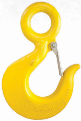
L-320R ROV EYE HOOK