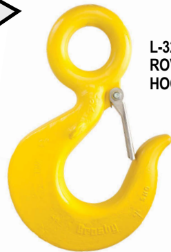
L-320R ROV EYE HOOK