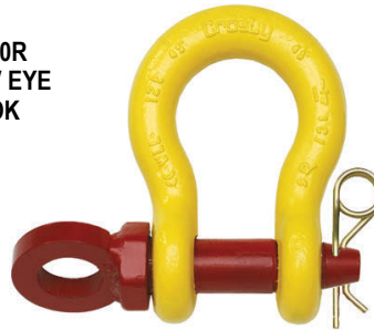
G-209R ROV SHACKLE