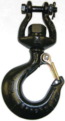
S-3316 REPLACEMENT HOOK