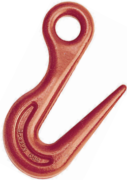
A-378 SORTING HOOK

*Ultimate Load is 5 times the Working Load Limit.