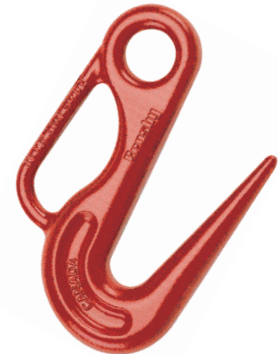
A-378 SORTING HOOK