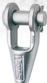
G-416 / S-416

Open Grooved Sockets meet the performance requirements of Federal Specification RR-S-550E, Type A, except for those provisions required of the contractor. For additional information, see page 452.