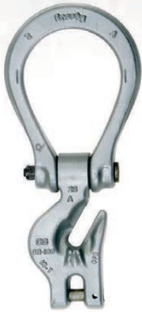
A-1361 Single Hook