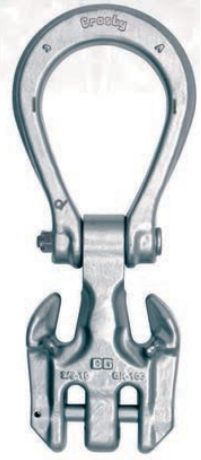
A-1362 Double Hook