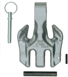
A-1360D Double Hook

* Ultimate Load is 4 times the Working Load Limit.