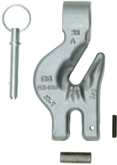
A-1360S Single Hook