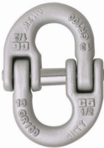
A-1337 10 Alloy Connecting Link

* Proof tested at 2 times Working Load Limit. Ultimate Load is 4 times the Working Load Limit.