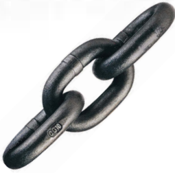
Spectrum® 10 Grade 100 Alloy Chain