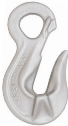
A-1348 Eye Cradle Grab Hook