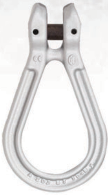
A-1370 Reeving Link