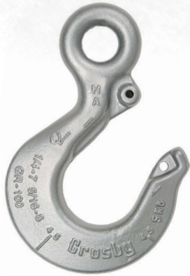
S-1327 Eye Sling Hook