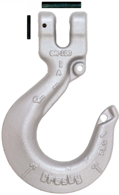
A-1339 Clevis Sling Hook