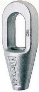
G-417 / S-417

Closed Grooved Sockets meet the performance requirements of Federal Specification RR-S-550E, Type A, except for those provisions required of the contractor. For additional information, see page 452.