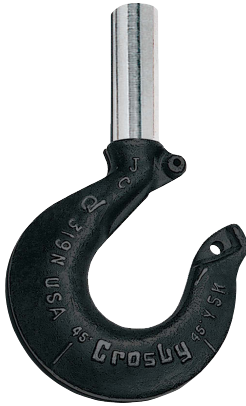
S-319SWG Shank Hook