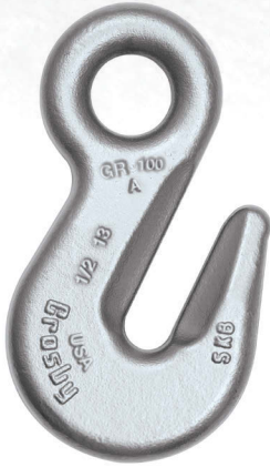
A-1328 Eye Grab Hook