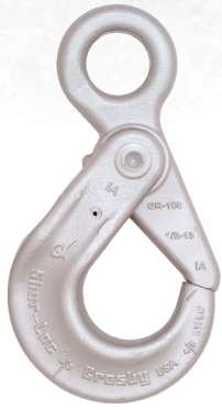
S-1316 EYE HOOK