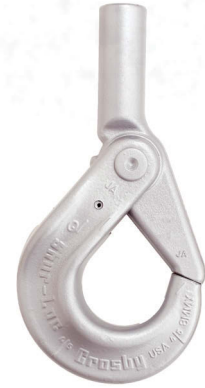
S-1318A SHANK HOOK