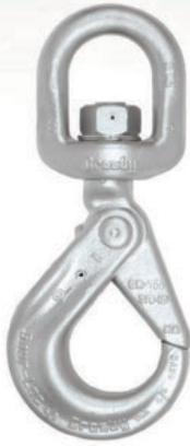
S-1326 SWIVEL HOOK