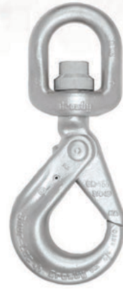
S-13326 SWIVEL HOOK with BEARING