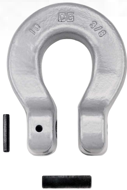
S-1325A Chain Coupler