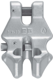
S-1311N Chain Shortener Link

* Minimum Ultimate Load is 4 times the Working Load Limit.