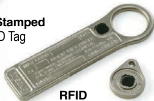
RFID Equipped Tags