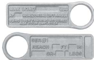
Forged ID Tags