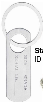
Stamped ID Tag