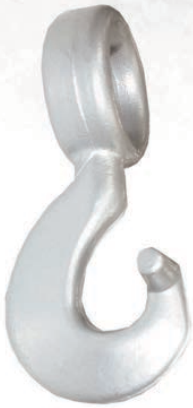
A-1355 Chain Choker Hook