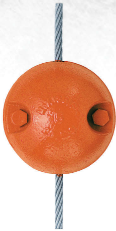
Split Overhaul Ball