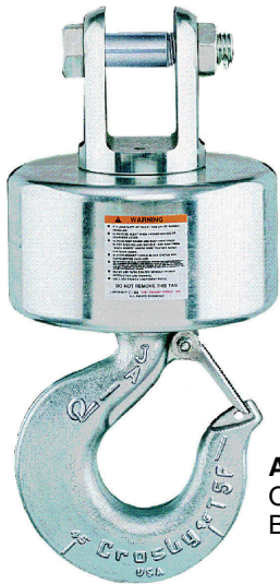
AS-15 Overhaul Ball