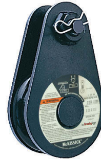
407 Tail Board