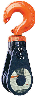
430 With Hook