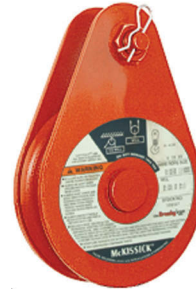
401 Tail Board