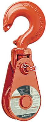
434 With Hook