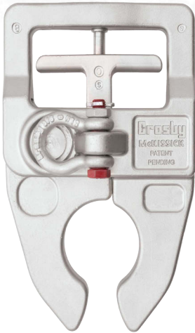
TGRB Tubing Grab