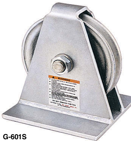
G-601S Vertical Lead Block