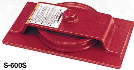
S-600S Horizontal Lead Block