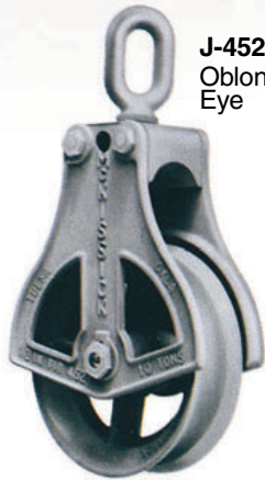
J-452 Oblong Swivel Eye