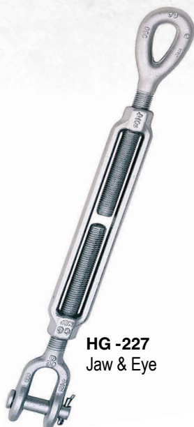
HG-227 Jaw & Eye