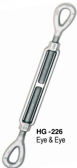
HG -226 Eye & Eye

Meets the performance requirements of Federal Specifications FF-T-791b, Type 1 Form 1 - CLASS 4, and ASTM F-1145, except for those provisions required of the contractor. For additional information, see page 452.