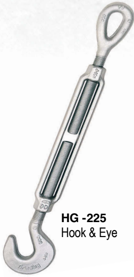
HG -225 Hook & Eye

Meets the performance requirements of Federal Specifications FF-T-791b, Type 1 Form 1 - CLASS 6, and ASTM F-1145, except for those provisions required of the contractor. For additional information, see page 452.