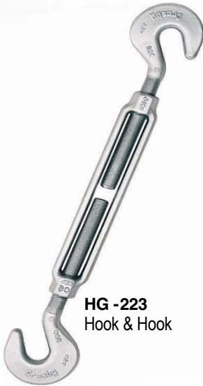
HG -223 Hook & Hook