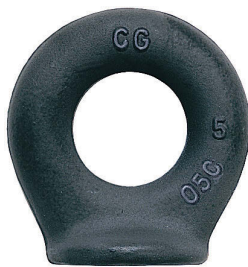
S-264 Pad Eye

*Ultimate Load is 5 times the Working Load Limit.