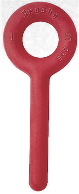
S-293 Rivet Eye Bolt