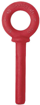
S-276 Shoulder Rivet Eye Bolt