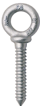
G-275 Screw Eye Bolts