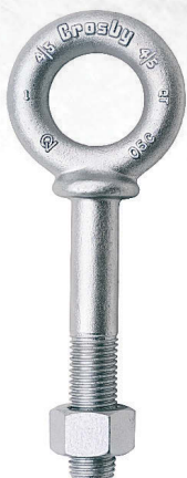
G-277 Shoulder Nut Eye Bolts