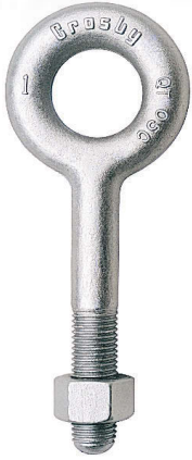
G-291 Regular Nut Eye Bolt