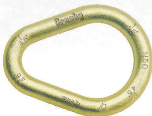
A-341 Alloy Pear Shaped Links