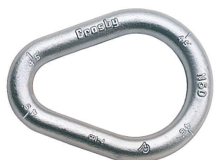
G-341 / S-341 Weldless Sling Link

*Based on single leg sling (in-line load), or resultant load on multiple legs with an included angle less than or equal to 120°. Minimum Ultimate load is 5 times the Working Load Limit. †† Welded Link.