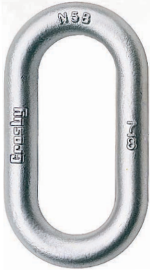
G-340 / S-340 Weldless End Link