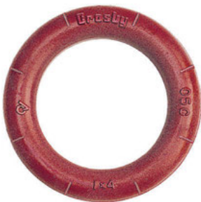
S-643 Weldless Rings

*Ultimate Load is 5 times the Working Load Limit. Based on single leg sling (in-line load), or resultant load on multiple legs with an included angle less than or equal to 120°.